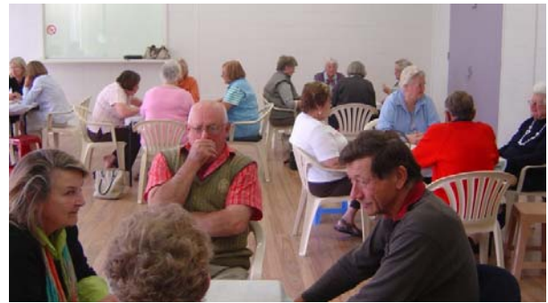
Thursday Duplicate at Rye Beach Bridge Club

The Monday morning session at Portsea serves a dual purpose – it provides a relaxed learning environment for new players and helps to build their confidence, while the format is ideal for those players who enjoy a social game without the competitiveness of master-pointed club events. The numbers at this session continue to grow.