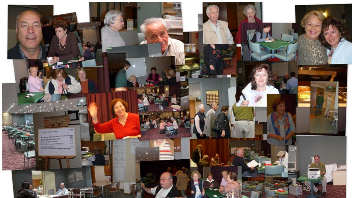
Thursday evening at the Theodor Herzl club

Congress: Sunday Jul 19: Swiss Teams Sunday Aug 30: Swiss Pairs 10 am start both days (Enter via web site)