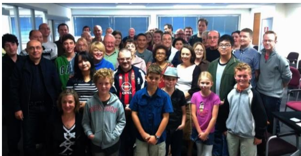
Contestants at the Victorian Youth Pro-Am