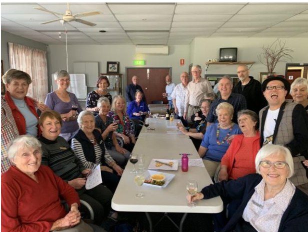
(Ballarat Bridge Club)

On my occasional forays into club bridge I play at the VBA which is as soulless a place as any I've been to so maybe it's time for everyone to take stock of their surroundings.